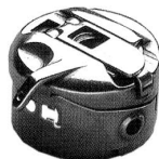
SC180-J JUKI AMS-210CGL