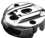
BC-457 FOR CONSEW 347, 375R, 376R, JUKI LZ-1280, -1286, -1287, MITSUBISHI LZ-720-11 BROTHER LZ2, SINGER 457G, 457U STAGER DZ-S31, SZ-310 TOYOTA AD550, A551