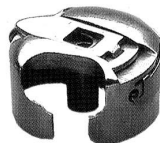
BC-DMB(2)-NBL1 WITH NBL-1301 SPRING LARGE CAPACITY FOR CONSEW 206RB, 208RB, JUKI DNU-241H, SEIKO STH-3BL, -7BL, 8BL, YAKUMO 280L, 880LM.