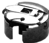
BC-DBM(Z1) LARGE CAPACITY FOR CONSEW 175, 176, ELTAC 900, 1800, SERIES STAGER SZ-21-1B, -21-5 TOYOTA D530, -18E, -30P, -101, -110, -120 SEIKO LZH, EVL