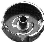
BC-DP2-(3B) BROTHER LH4-B814, 2, 3, 4, 102