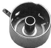
BC-LK(J3) FOR JUKI AMS-210A, 12A LK1850