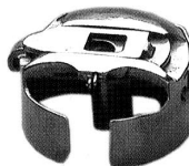
BC-DBM(Z2) LARGE CAPACITY FOR TAJIMA