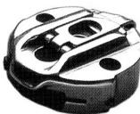
BC-PF3114 FOR PFAFF 114cL, 115cL, 116cL, 117cL, 3114cL, 3116cL