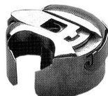
BC-DBM(1) LARGE CAPACITY FOR BROTHER, CONSEW, JANOME, JUKI, MITSUBISHI, SINGER, TOYOTA, TREASURE, YAKUMO, YASIMA