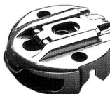
BC-LBH771 FOR JUKI LBH-771, -772, -773, -781, -4