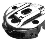
BC-107(2) WITH SPRIT TENSION SPRING FOR ADLER, BROTHER, CONSEW, DURKOPP, JUKI, MITSUBISHI, PEGASUS, SINGER 107G, 107W3, 14, 15, 50, 143W1, 2, 3, 18, 307G2 YAMATO